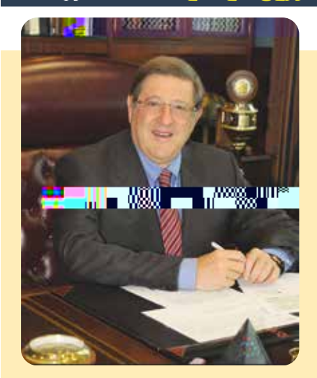
FRO T D S O R S NT AR GOUS